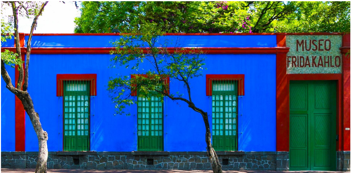
Top: The St. Regis. Middle: Bottom: La Casa Azul.

The St. Regis Mexico City , our accommodation for the week, is a sanctuary in one of the most exciting destinations in the world. Soaring 31 stories above the city bustle, this hotel stands along the tree-lined Paseo de la Reforma bringing elegance into the modern era, elevating an otherwise typical hotel experience to a higher standard that reflects the evolution of this world-famous metropolis. Anticipate refined spaces with nods to the rich local culture of Mexico City, meticulously crafted and brought to life by renowned butler services.