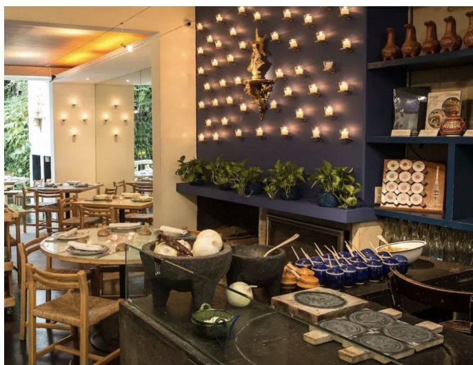
Top: Zona Maco 2024. Bottom Right: Rosetta Restaurant Interior Mexico City. Bottom Left: Azul Condesa Gallery