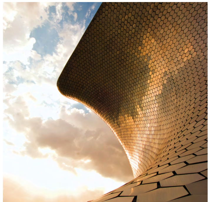
Bottom left: Visitors at ZONAMACO 2023 . Bottom right: Façade of the Plaza Carso building of Museo Soumaya .