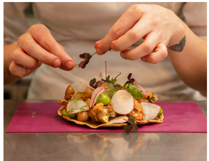
Bottom left: Museo Nacional de Antropología. bottom right: A dish at Maximo Bistrot via their website.

No refund will be provided for cancellations within sixty days of the trip's start date. If the museum has another patron to fill a spot a substitution will be allowed. After the trip has commenced, no refunds are available, even if the client does not partake in all of the trip's activities or leaves the trip early. We highly recommend trip insurance offered when booking. All programming may change and is subject to availability of hosts, collectors and artists.