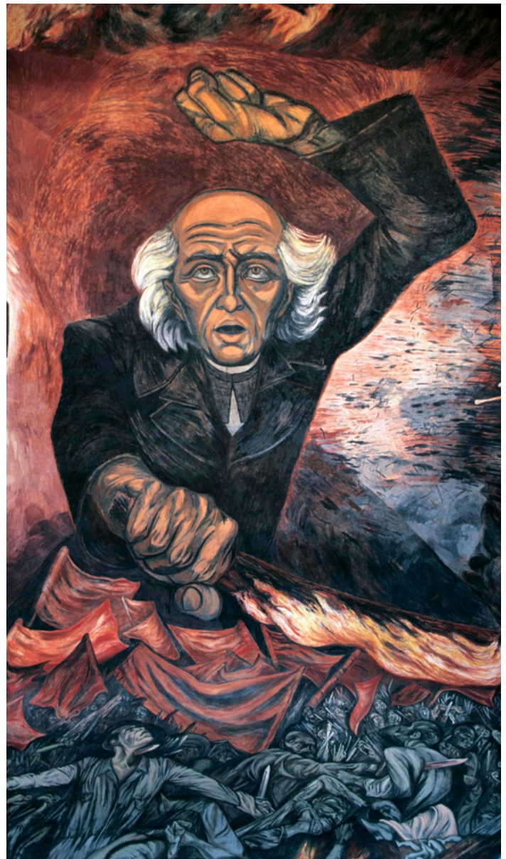
Bottom: Father Hidalgo mural at Government Palace in Guadalajara Mexico.