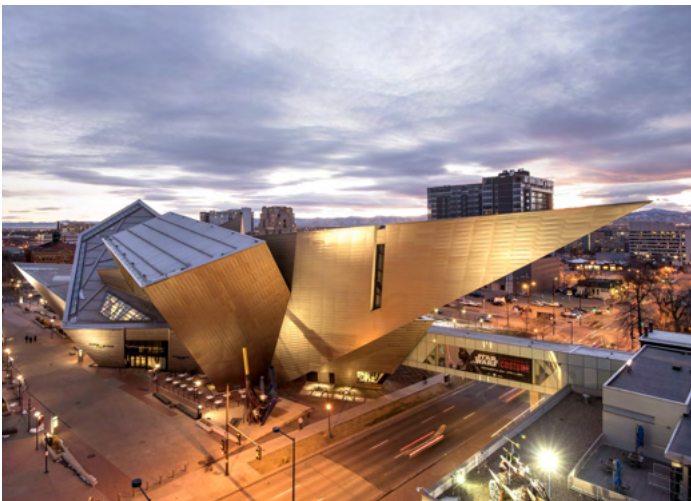
Bottom left: Denver Art Museum, Frederic C. Hamilton Building. Top right: Dish at The Ponti Restaurant.