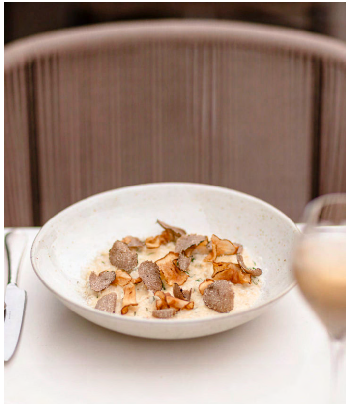
Bottom left: Artist William Kentridge, Top right: Suite at Le Bristol in Paris, Bottom right: Mushroom Risotto at Orrery, London.