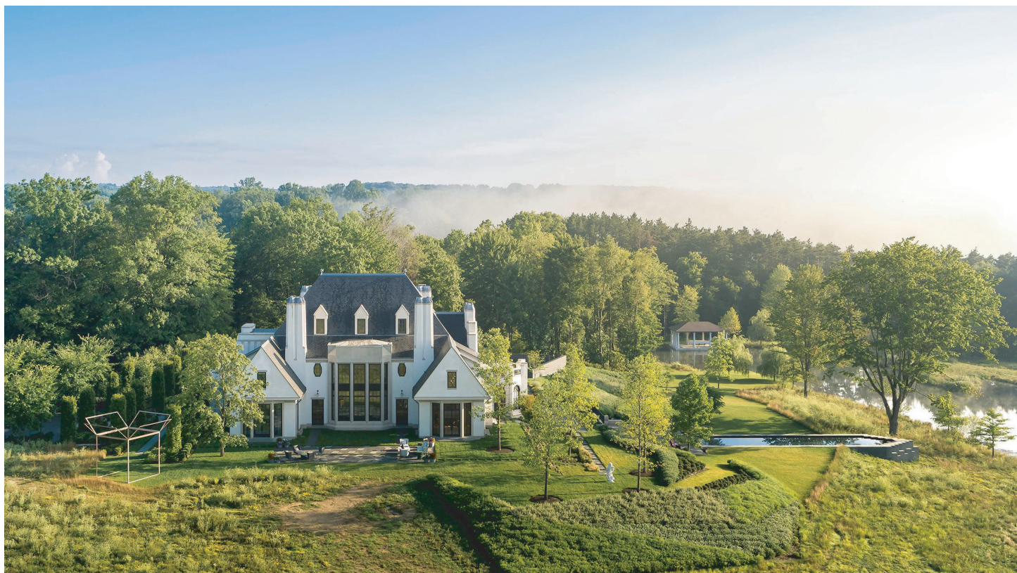
Rowdy Meadow

VIA's trip itineraries are subject to change up until the commencement of the trip. There is no minimum number of guests required to operate this trip, but the price may increase if there are under ten partners. Your booking is requested by May 26th, 2022.