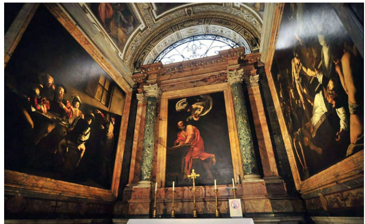
Top right: MAXXI (National Museum of the Arts of the 21st century). Bottom Right: Caravaggio works at the San Luigi dei Francesi. The program is subject to changes based on our hosts availability.