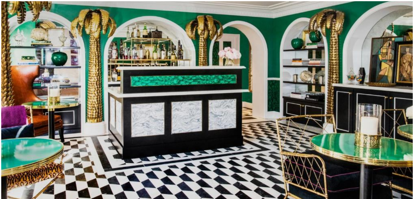
Top Right: Funke LA. Middle Right: In the Studio with Catherine Opie. Bottom: The Prospect Hollywood.