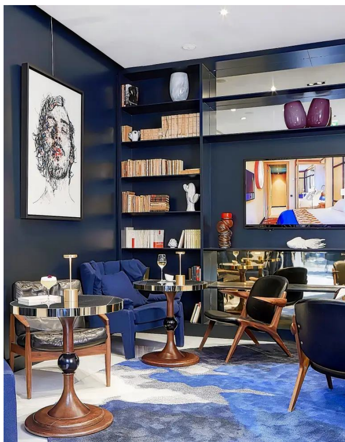
Top: Paris, France. Bottom Left and Right: Hotel Bel Ami.