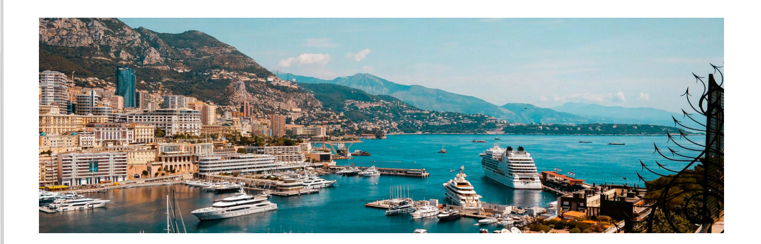
Top: Festival International du Cirque de Monte-Carlo by Ekaterina Chesnokova via Visit Monaco. Bottom: Monaco by Rishi Jhajharia via Unsplash.

No refund will be provided for cancellations within sixty days of the trip's start date. If the museum has another patron to fill a spot, a substitution will be allowed. After the trip has commenced, no refunds are available, even if the client does not partake in all of the trip's activities or leaves the trip early. The final payment due will be automatically charged to the same credit card used for registration, 60 days prior to the trip. We highly recommend trip insurance offered when booking.