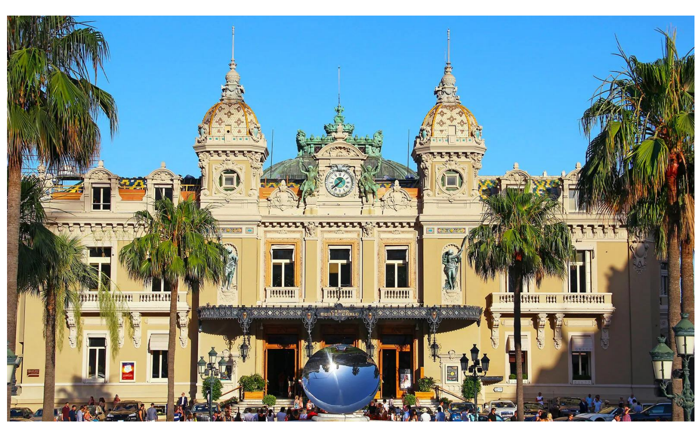
Top: Fairmont Monte Carlo Dining. Bottom: Casino de Monte-Carlo in Monaco.